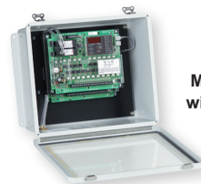
Master board stacked with channel expander