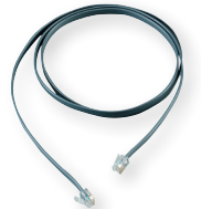
DCAC02 cable connection for connecting multiple boards