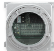
DCT in optional Explosion-proof enclosure