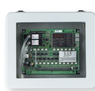
DCT in optional NEMA 4/4X weatherproof enclosure